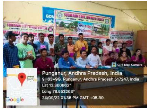
Winners with prizes